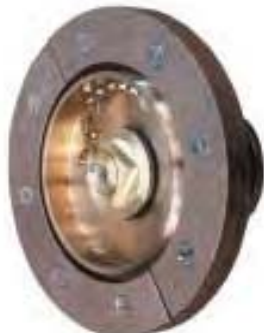
PEM 6338-62 with Plug