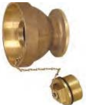
PEM 6338 & Plug